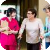
Caregivers and/or Families