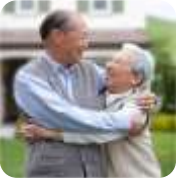
Nevada's Elders; Age 60+