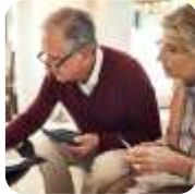
Anyone with LTSS needs