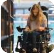
People With Disabilities