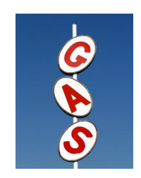
Glucose = gasoline