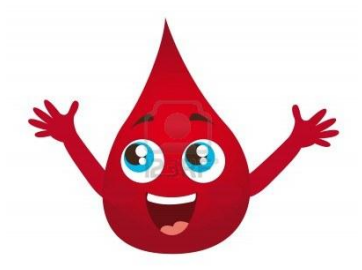
blood sugar goes down