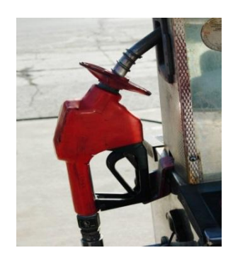
Insulin = nozzle