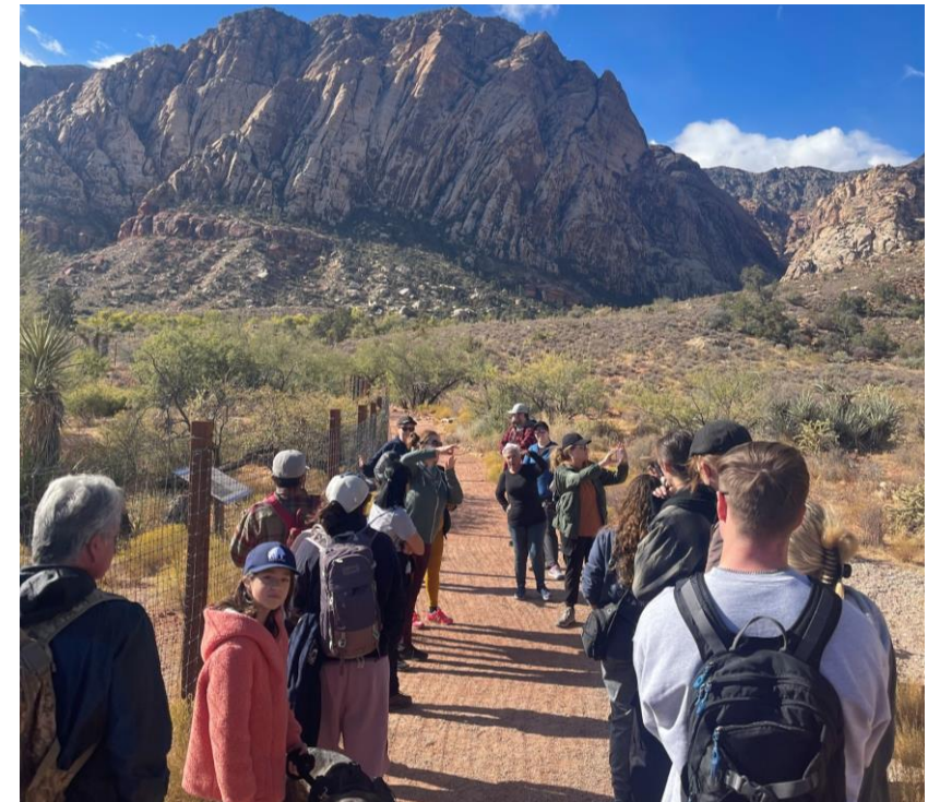
27 participants for Silent Hike