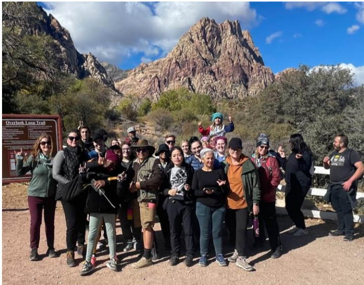
First Deaf Hike at SMR