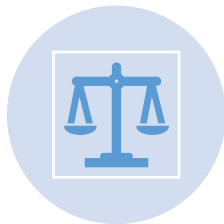
DURABLE POWER OF ATTORNEY FOR HEALTHCARE DECISIONS