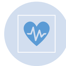
DO NOT RESUSCITATE ORDERS (DNRS)