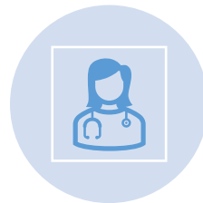
PROVIDER ORDER FOR LIFE-SUSTAINING TREATMENT (POLST)